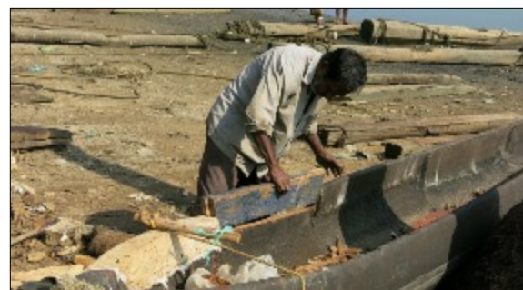
Figure 2. Monoxylous craft used on Goa's rivers. They are so heavily coated in dikh that sewn portions are difficult to detect: a) upturned with booms still attached. Assolna; b) under repair on the slip at Cavelossim. Author.