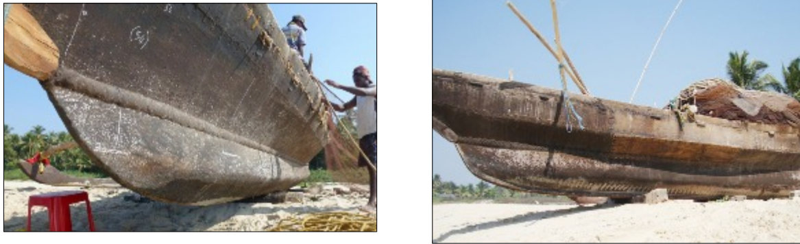
Figure 5. a) an outboard padded seam between underbody and flaring garboard; b) the flare of the garboard varies and may with age, deform under the weight of nets and need to be renewed. Benaulim.

Within living memory a maximum of three strakes was employed to create the form, even of a pirogue 18m long (Fig. 6). In recent years the shortage of large trees and substitution by saw-mills of boards in standard widths have necessitated replacement with more and narrower strakes during successive repairs.