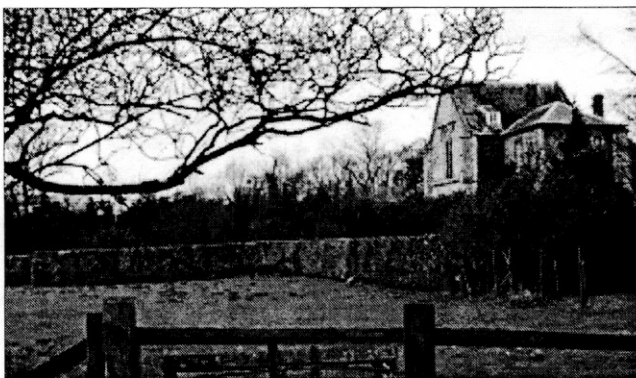
Upper left: Christchurch Mansion, Ipswich, built by Edmund Withipoll in 1548-50 on the site of an Augustinian priory